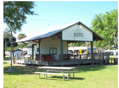
Lutz Train Depot